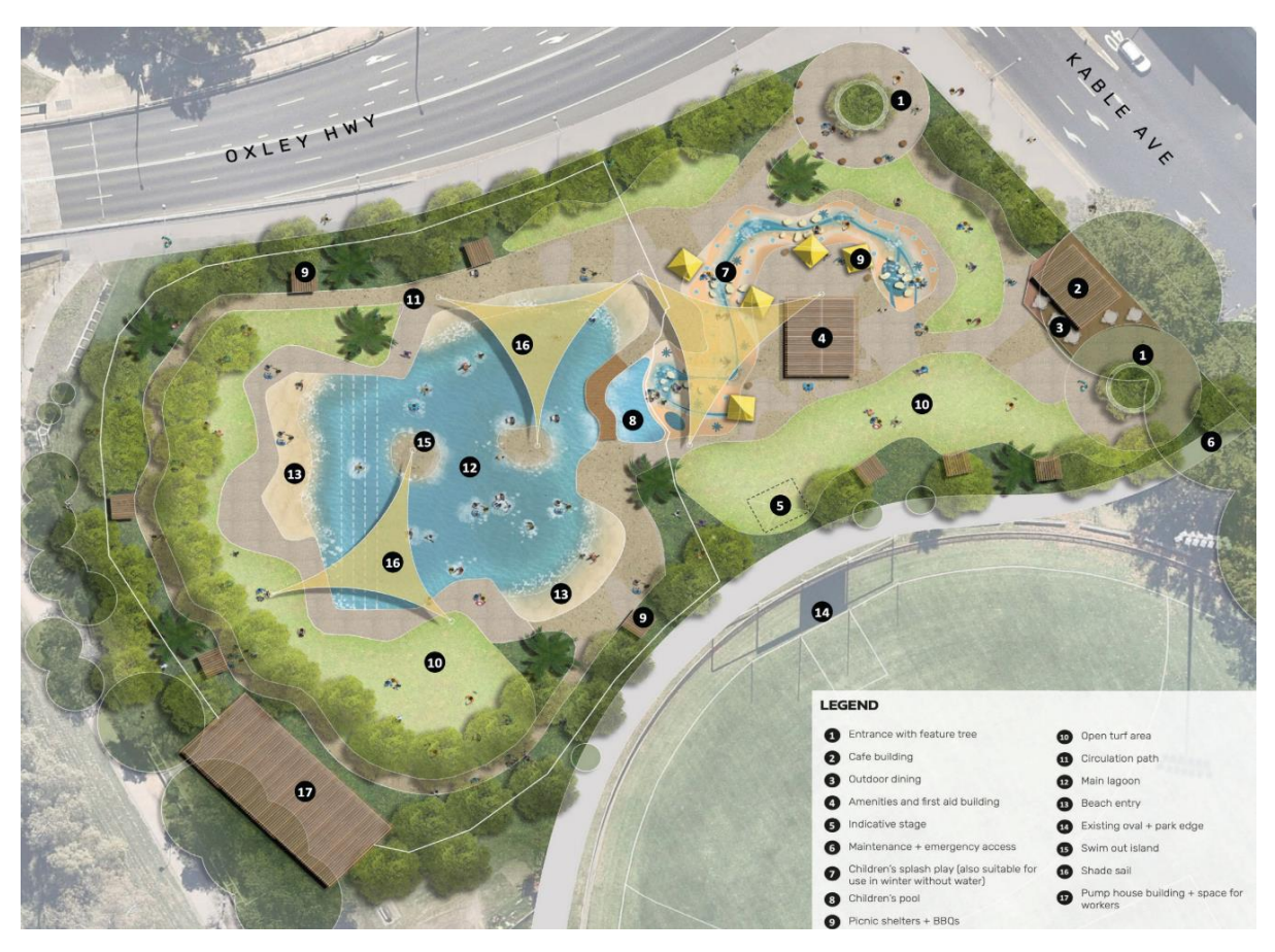
Figure 1 – Concept proposal option for the Lagoon