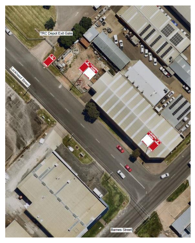
Figure 2: Proposed No Stopping sign changes on Lockheed Street, Taminda

COMMITTEE RECOMMENDATION: the Committee supports the installation of No Stopping signs either side of the rear access driveway of 59 Barnes Street and defining a Loading Zone from south side of the driveway to the Barnes Street/Lockheed Street intersection.