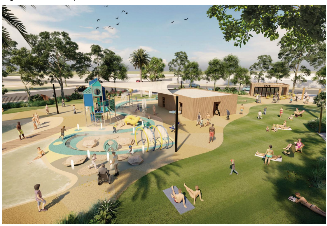
Figure 2 – Artist impression of the TAP